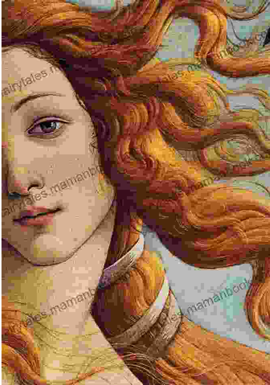
Detail of the face of Venus from "The Birth of Venus" by Sandro Botticelli

Sandro Botticelli's "The Birth of Venus" is an enduring masterpiece that embodies the beauty, grace, and idealism of the Italian Renaissance. Its iconic imagery, rich symbolism, and masterful execution have made it a timeless work of art that continues to captivate and inspire viewers around the world.